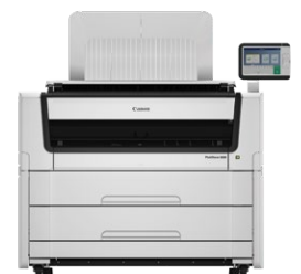
PlotWave 5000/5500 printing systems