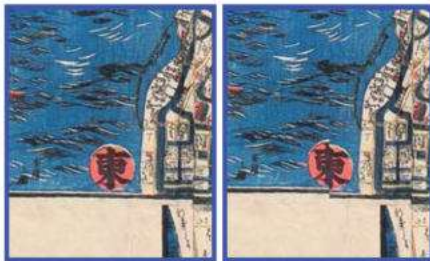
▲ No image stitching

Adopted with a high-standard optical image component, LS-4600 can capture an A0-size image by single lens, preventing occurring of errors for image stitching generated by dual lens.