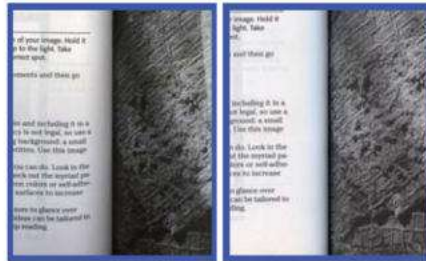
One-Way Light Source

LS-4600 provides you with fantastic experiments of large-scale images scanning, such as historical documents and data processing and guarantees superior color quality at the same time.