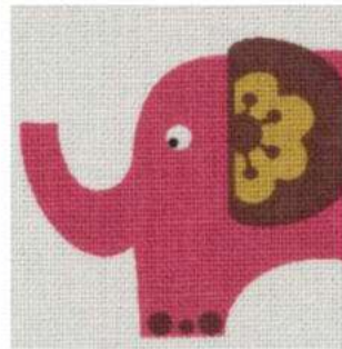
▶ Before applying with the Texture Smoothing function

This software is specifically designed for digital textiles and printings, offering many image improving functions, such as Texture Smoothing, Luminosity Sharpen and Detail Enhancement. ScanWizard DTG is good for using on printing digital patterns in textile, printing, dyeing and ready-to-wear industries.