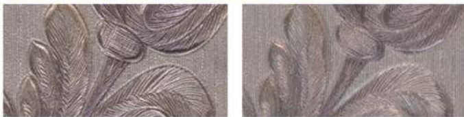
▶ One-way LED light source More stereoscopy