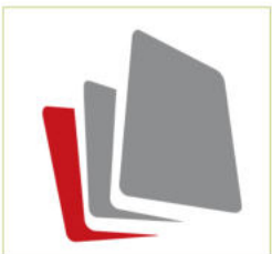
SD 3600 is designed for convenient scanning of technical documents

The sleek and modern design makes transport and setup an easy task.