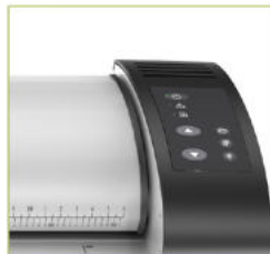
3 programmable One-Touch buttons for easy handling