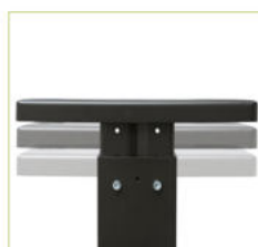
Height adjustable stand for optimal ergonomics