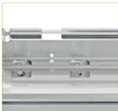
Context Unibody CIS Technology