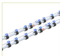
All-Wheel-Drive (AWD) for a perfect document grip