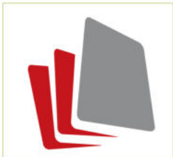
IQ Quattro is recommended for workgroup usage