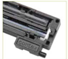
Contex CleanScan CIS