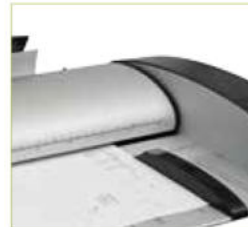
Guides for easy handling