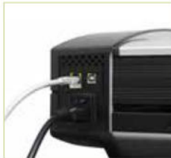
Up to 14 ips in color across corporate networks