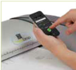
Cloud enabled with PageDrop